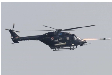
The Indigenously developed helicopter launched Anti-Tank Guided Missile 'Helina' was successfully flight tested on Monday.

The flight trials were conducted from an Advanced Light Helicopter (ALH) and the missile was fired successfully engaging a simulated tank target. The missile is guided by an Imaging Infra-Red (IRR) Seeker operating in the Lock on Before Launch mode. It is one of the most advanced anti-tank weapons in